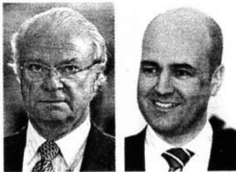
GAME CHANGE From left: King Carl Gustaf, Prime Minister Fredrik Reinfeldt.

share of students has grown from 1 percent to 10 to 15 percent.